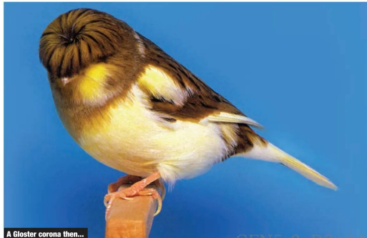
A Gloster corona then...

The Gloster fancy canary's 100th anniversary is a testament to the dedication, creativity, and passion of its breeders and admirers. From its humble beginnings to its status as a global icon, the Gloster continues to enchant and inspire. As we honour its past and embrace its future, one thing is certain: the Gloster fancy canary will forever hold a cherished place in the hearts of bird lovers worldwide.