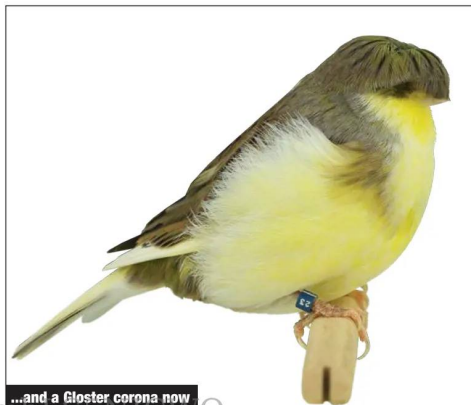
...and a Gloster corona now